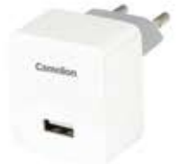
AD566 Wall Charger