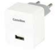
AD568 Wall Charger