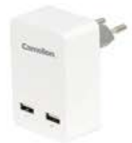
AD569 Wall Charger