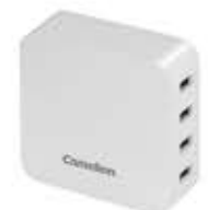
AD570 Desktop Charger